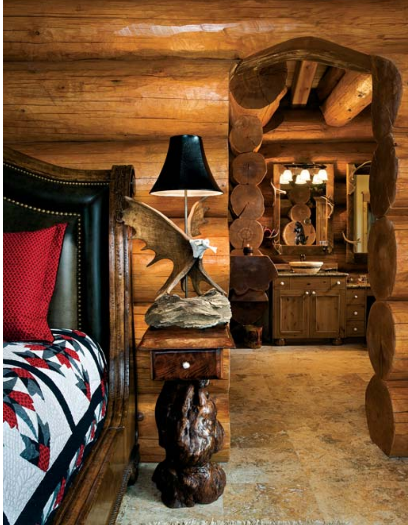
ABOVE: The pecan vanity in the master bathroom is visible through the dramatic carved archway. Fish's Antler Art crafted the leather framed mirrors. David Arnold's burl pine base with a redwood top supports another of Fish's creations: an eagle lamp shaped out of moose antlers.