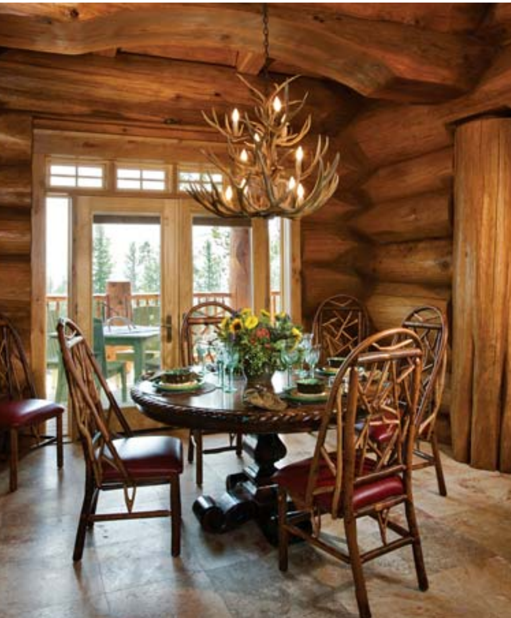
LEFT: Gracefully arching large-diameter logs distinguish the dining room. The hickory chairs weigh 60-plus pounds each, but the Smiths say they're extremely comfortable. The travertine tile floor grounds and complements the logs. Patio doors open to the eating area of the deck.