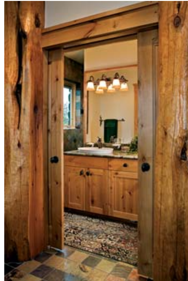
OPPOSITE: Alder pocket doors (left) slip away into the wall behind the accent logs added to carry the log feel to the lower level. Six-by-six slate tiles and pecan cabinets contribute to the home's casual elegance. A small carved bear (right) stands guard outside the lower-level sauna.