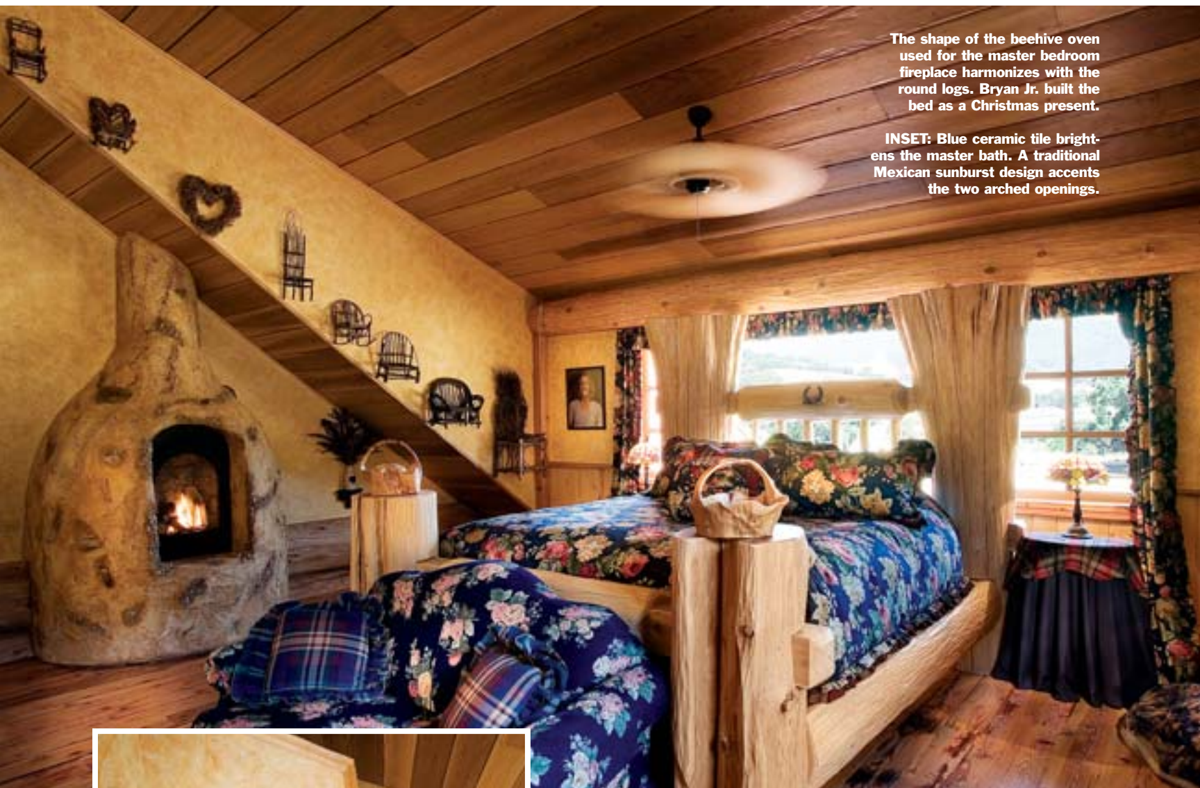
The shape of the beehive oven used for the master bedroom fireplace harmonizes with the round logs. Bryan Jr. built the bed as a Christmas present.