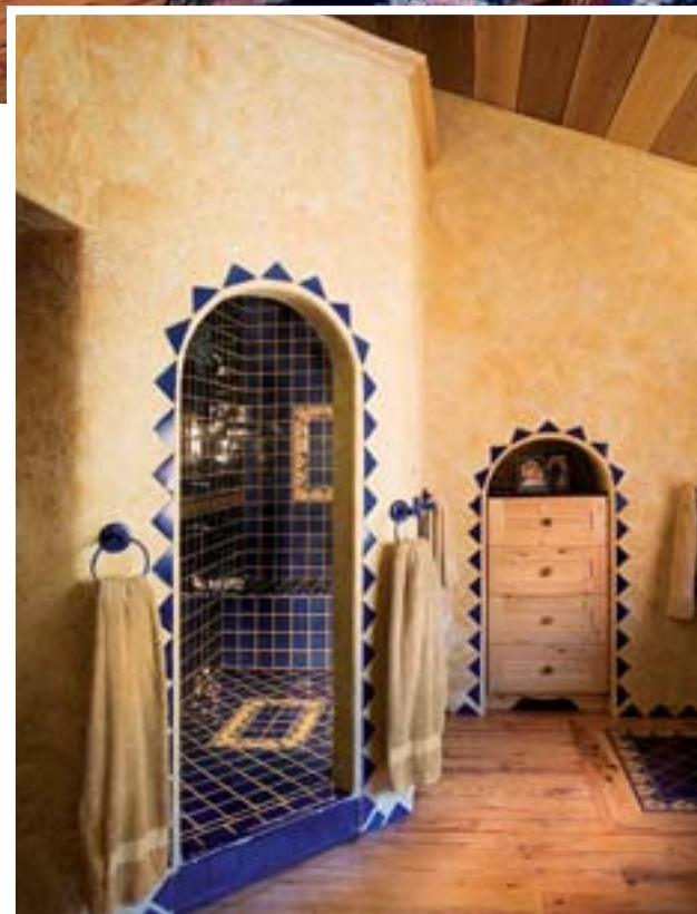
INSET: Blue ceramic tile brightens the master bath. A traditional Mexican sunburst design accents the two arched openings.

advantage of views of the Santa Ynez Mountains.