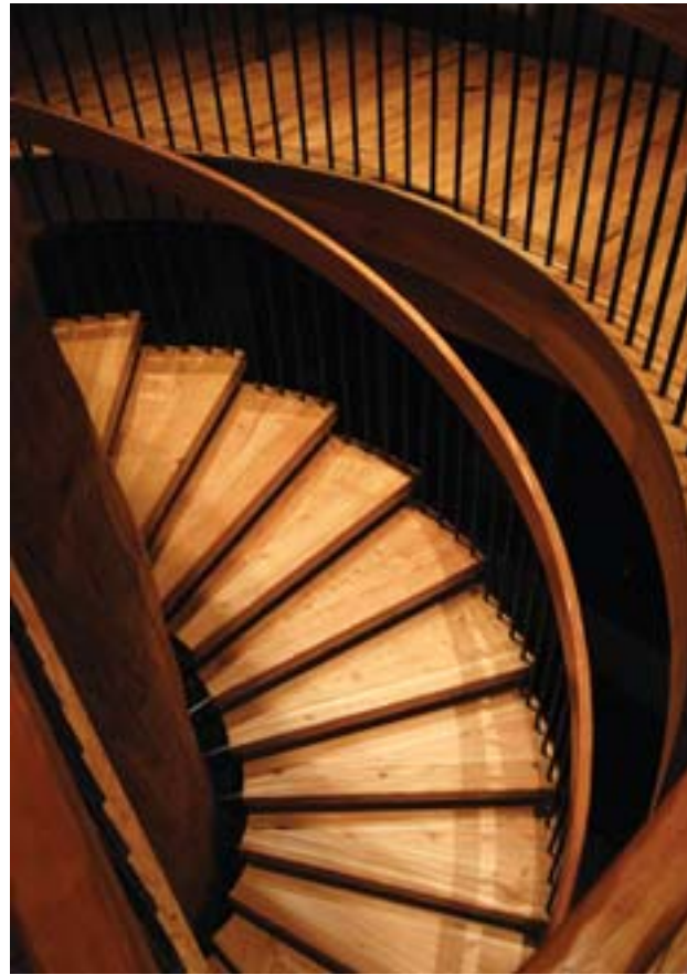
Left and Below: Along with the cedar logs, Pioneer sent Douglas fir timbers and Gunter, using a CNC machine, crafted the planks for a circular staircase to the tower room, which serves as the home office. In addition, there is a suspended bridge above the main foyer that adds even more character to the area.