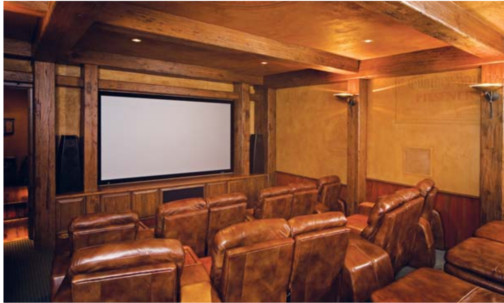
Left: Another appealing aspect of the lower level's recreational area is the indoor multi-media room that features all the latest gadgetry.