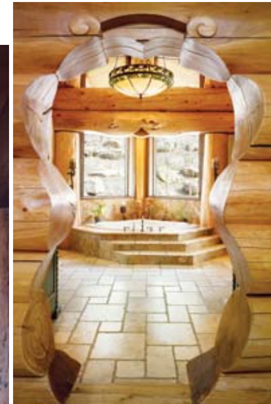
Left: Pioneer had to talk Gunter into the hourglass-shaped doorway to the master bathroom, but visitors have been uniformly impressed. And Gunter says that it's grown on him to a very comfortable degree.