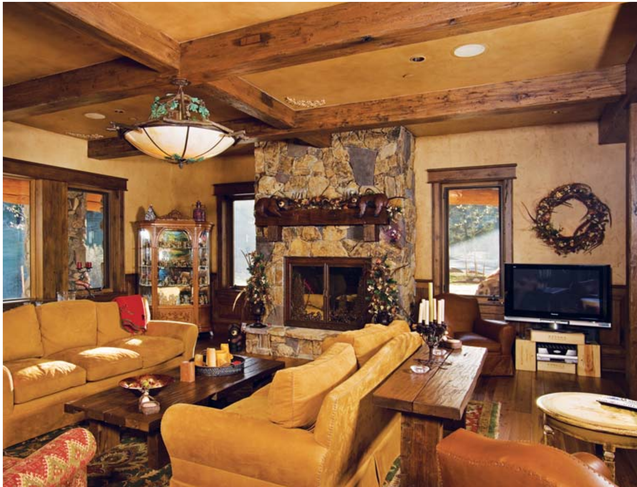
Above: As part of the recreational area on the lower level, this comfortable seating area has been the site for many great conversations and lots of laughter.