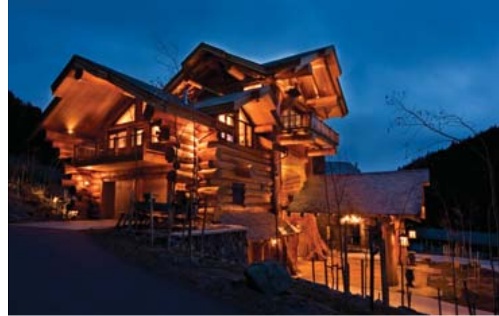
Left: Extensive exterior lighting not only shows off the home at any time of the day or night, but allows the Preuss family and guests to enjoy the play of shadows among the many angles, gables and corners of the home.