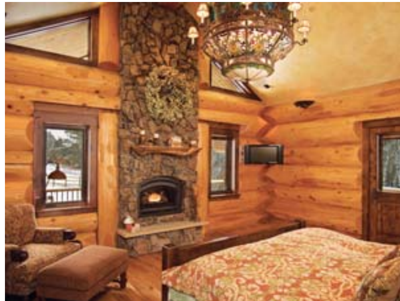
Above: Attention to detail was exceptional throughout the house. The mantel above the fireplace in the master bedroom, for example, came from the cedar rootballs, while another handcrafted chandelier (such as might be found in many great rooms or dining rooms) hangs overhead.