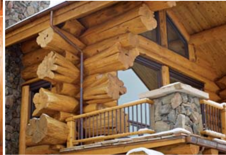
Left: One of the reasons the Preusses loved working with Pioneer is because of their custom scribing that retains the irregular shape of the cedar logs. "Some people might refer these as natural defects," notes Gunter, "but we loved the character it brought to our home."