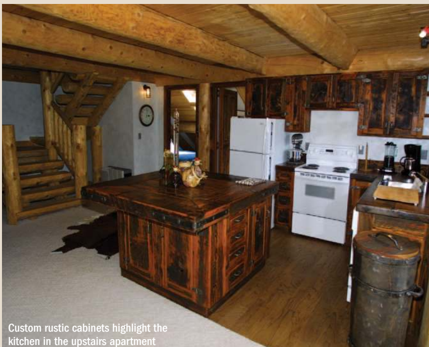
Custom rustic cabinets highlight the kitchen in the upstairs apartment