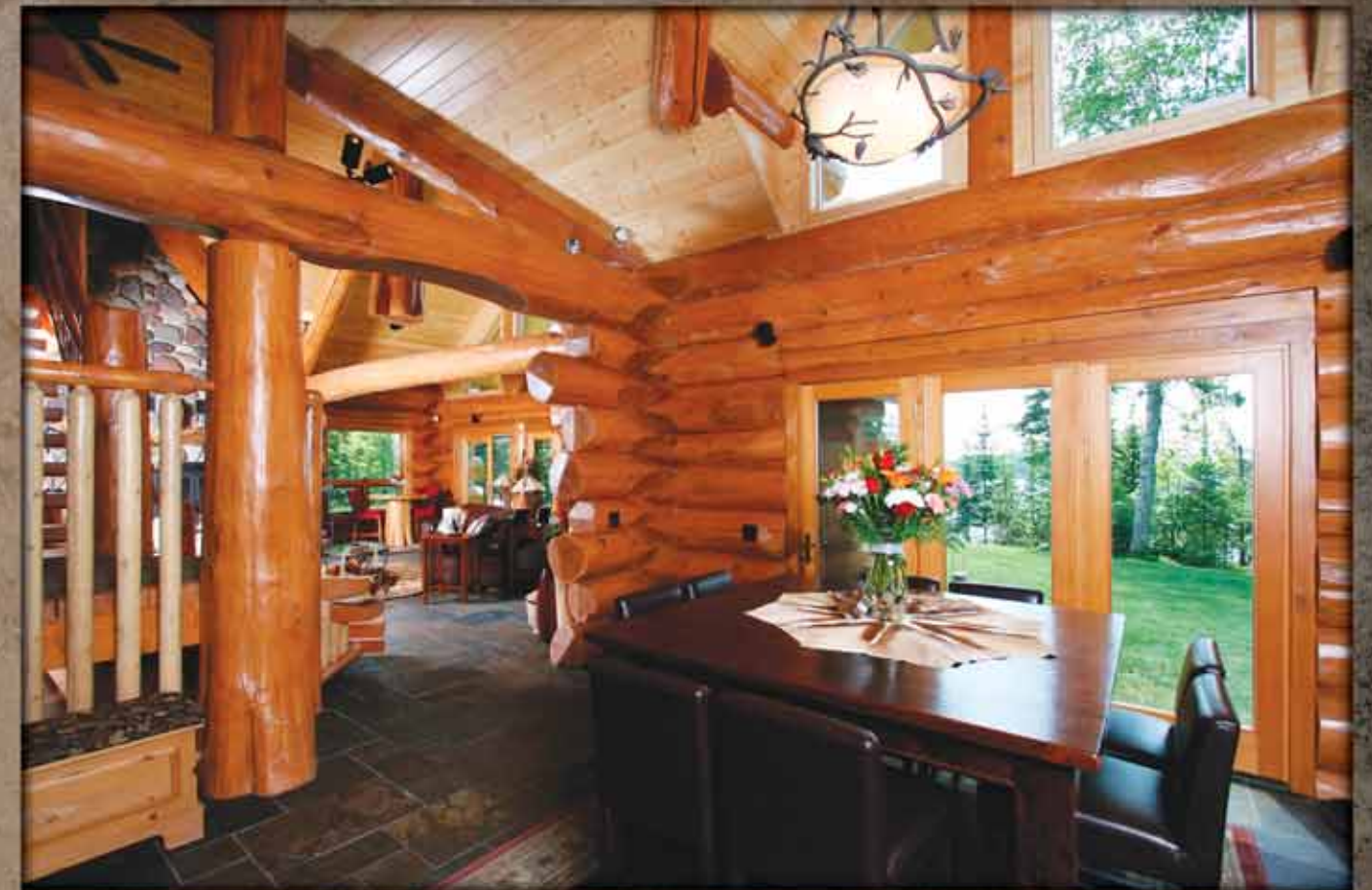
Each of the massive western red cedar logs was hand-peeled and then assembled in British Columbia. They were then disassembled, transported to Tom and Brenda's property in Wisconsin, and reassembled over a five-day period.

rooms and hallways. Our house is much more open. There are very few spaces that are isolated," Tom explains. The couple aimed for an open lodge ambiance, with the ceilings elevated 25 feet in the middle of the living room.