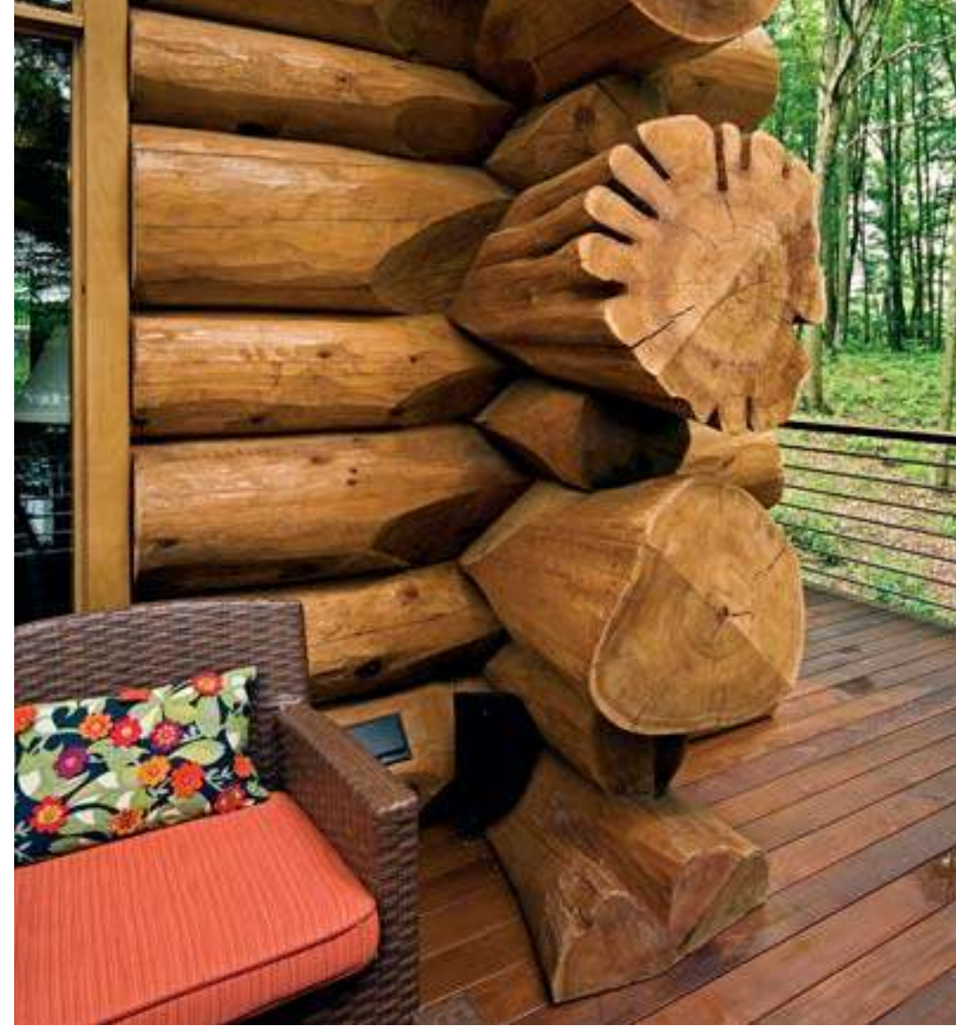
OPPOSITE: The sunroom provides a cheery retreat off the great room in the open floor plan. Large windows merge indoors and outdoors, the latter being represented not just by the view, but also by the rugged logs. Cushioned rattan furniture bolsters the informality, and a wool rug adds a welcome splash of color.

The homeowners, who visit their cabin at least twice a month, are thrilled with their nouveau-rustic retreat. It was especially fun, they agree, to bring together ideas they'd wanted to use for clients but finally were able to use for a design that's totally their own. 🏡