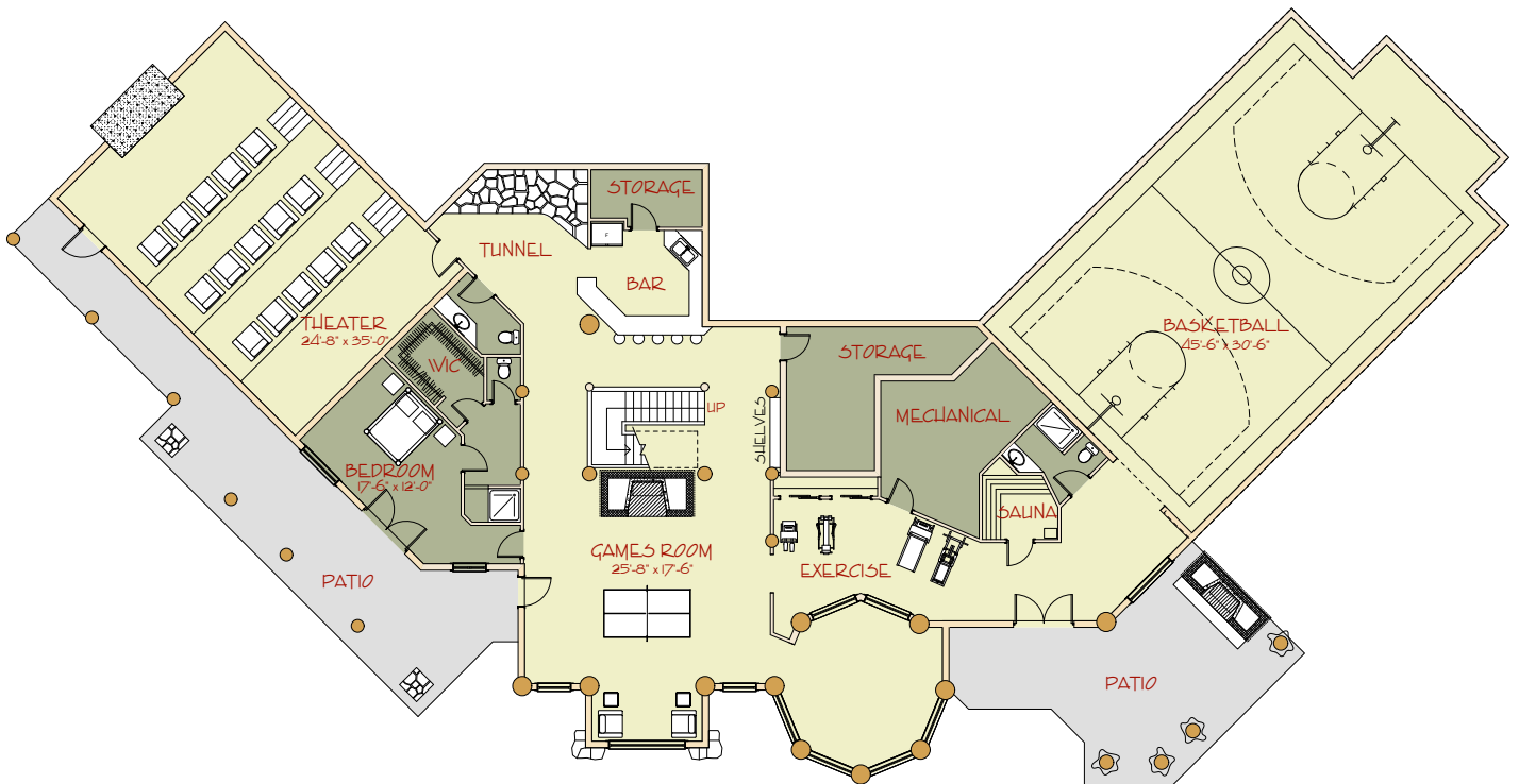
BASEMENT FLOOR PLAN